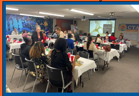
CTA Dinner & Trivia Night