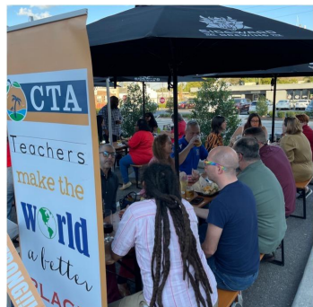
December CTA Social